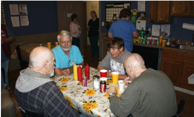
Conowingo Veterans Center dining area