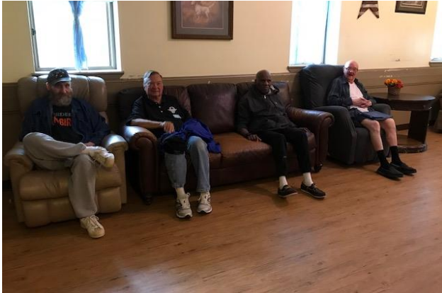
Conowingo Veterans Center Residents