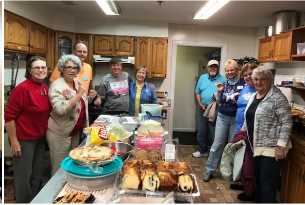
and The Feast