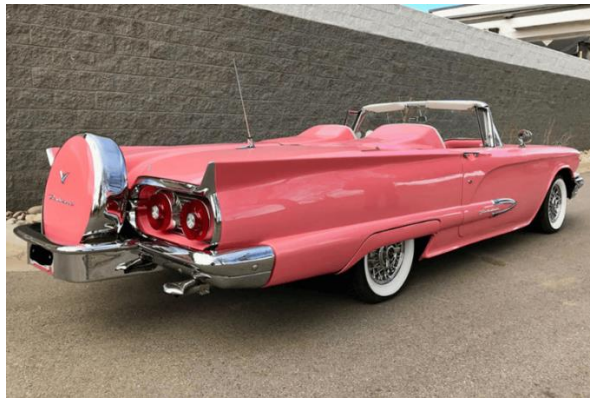
The Exterior of the 1959 Ford Thunderbird Convertible

Let's not forget the finishing touches that made this car a true collector's dream! A Continental kit, that little spare tire mounted on the back, added a touch of class. And those iconic wire wheels wrapped in wide white wall radial tires? Pure 1950s Americana.