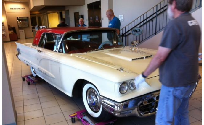
Tom's 1960 Thunderbird being staged for display